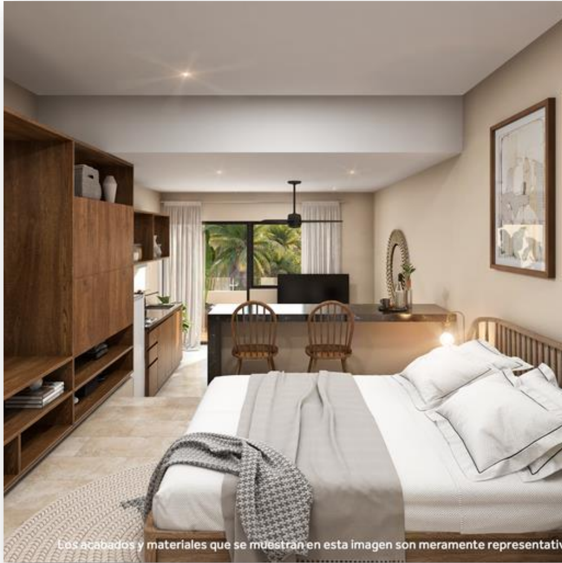
Los acabados y materiales que se muestran en esta imagen son meramente representativos