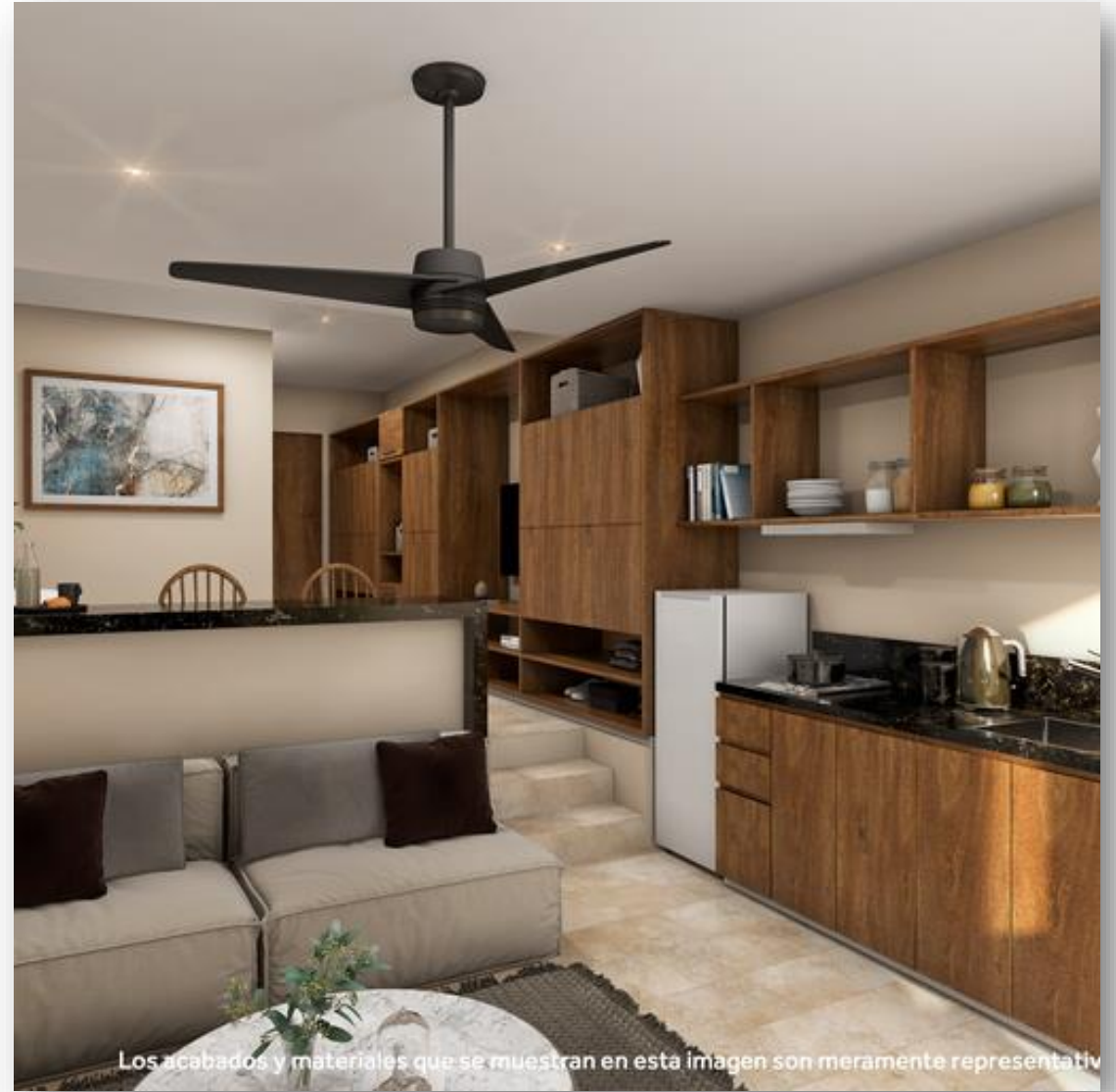
Los acabados y materiales que se muestran en esta imagen son meramente representativos